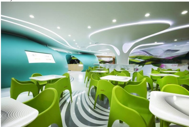
Figure 5. Lotte Department Store in Seoul, South Korea by Kareem Rasheed

The type of ceiling is not the only influencing factor – the height of the ceiling and design plays a role as well. Drop ceilings, also known as suspended ceilings, are found in many homes today, and they are installed in almost all basements and other rooms. They have two parts - the first is the suspended metal grid to which the second, the acoustic panels, are attached to. These panels are inserted into the metal grid. Decorative options are available such as metal panels or coffered panels. Such a design is relatively flat, without any angles or geometric features beyond the natural shape of the room. Ceiling tiles can be smooth or textured, capitalizing upon antique tin designs that complement traditional and contemporary spaces. Such tiles attach directly to an existing ceiling, which means they work well with any geometric space and can increase the volume in a room (Mitton & Nystuen, 2007, p. 22).