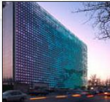
Fig. 5. GreenPix, Zero energy Media wall, Beijing, 2008