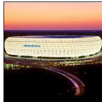
Fig. 3. Allianz Arena, Munich, 2005.

The most important issue in the media façade is how to integrate the display onto the building façade and into its operation. Successful media architecture emerges when all factors are well planned and incorporated into the project functionality and goal(s). Examples include Chanel Tower, Tokyo (Fig.4) and GreenPix, Zero energy Media wall, Beijing (Fig.5) [2]. Another important factor for successful integration is proper coordination between the dimensions of the media and the dimensions of the building. This may prove particularly challenging when the building exterior and second skin integrating the media are not flat (e.g. National Library Project, Belarus (Fig.6) or Allianz Arena Building, Munich (Fig.3) where the entire building serves as a single and 3-dimensional screen.