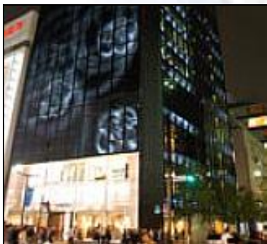
Fig. 4. Chanel Tower, Tokyo, 2004.

The most important issue in the media façade is how to integrate the display onto the building façade and into its operation. Successful media architecture emerges when all factors are well planned and incorporated into the project functionality and goal(s). Examples include Chanel Tower, Tokyo (Fig.4) and GreenPix, Zero energy Media wall, Beijing (Fig.5) [2]. Another important factor for successful integration is proper coordination between the dimensions of the media and the dimensions of the building. This may prove particularly challenging when the building exterior and second skin integrating the media are not flat (e.g. National Library Project, Belarus (Fig.6) or Allianz Arena Building, Munich (Fig.3) where the entire building serves as a single and 3-dimensional screen.