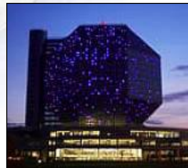
Fig. 6. National Library, Belarus, 2006.