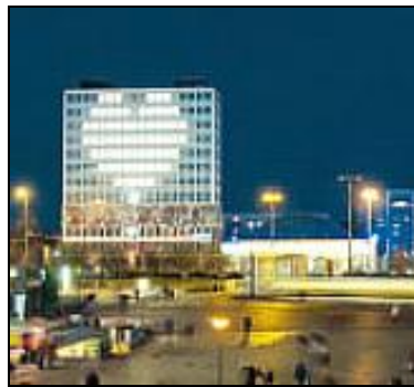
Fig. 2. Blinkenlight Building.