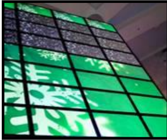
(Fig.8) Illustration example; Re-Used Display Systems as Sustainable Media Facades

Every Media façade has its own alternative design options. Depending on geographic, orientation and exposure of the design place, The media facade gets more or less usable sunshine. weather patterns vary due to topography and landscape details as well. The size of the PV panels and the type of the PV cells have to be decided according to the electric power needed by the media mesh. So collecting information and calculating them gives the start in making important design decisions to build the sustainable media façade.