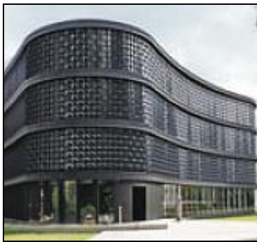
Fig. 1. Flare project process.

A wide range of technologies exist which support light and movement in a media façade. Some are kinetic and others are static, in both the movement of light plays a main role in design. Examples include the use of sunlight or ambient light to create surface effects and image information (e.g.. Flare project) Fig.1 . Or using a number of screens to serve as pixels and for larger scaled, more detail images (e.g. Blinkenlight 144 pixels ( Fig.2 ), [1]. Various electric lighting sources (e.g. LED, fluorescent, and others ...) can be used to generate the light used in these media facades resulting a range of image properties and resolutions.