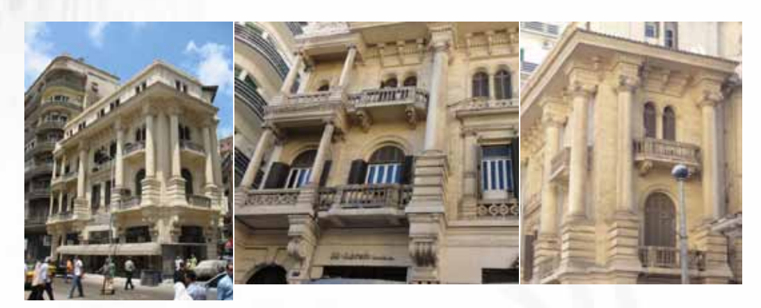
Fig. 2 : Ornamental details of a High Eclectic Mannerist building; with a mix of different styles; plain shaft Ionic columns and pilasters, egg and dart motifs resembling life and death, cornice with dentils, variety of bracket ornaments some with animals heads and some with acanthus leaves others with voluted form, balcony balustrades with columns and scroll motifs, stone effect walls. (Fouad St.) (Palazzina Agion, 1887) (Now a branch of AlAhram Newspaper)