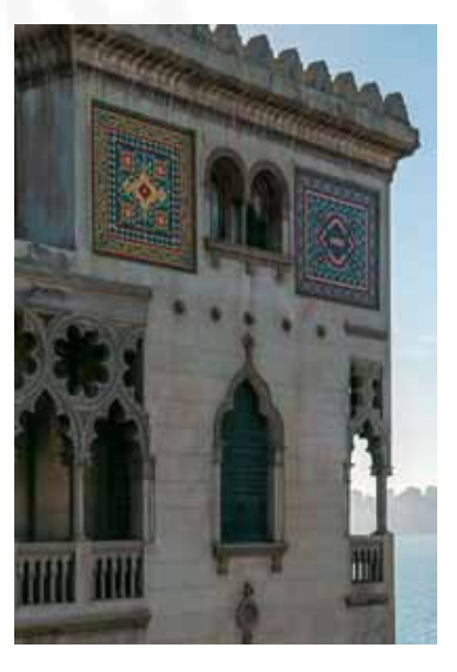
Fig. 6 : Ornamental detail of Venetian Gothic Style residential building "Little Venice"; repeated pointed cinquefoil arches, rosettes and arcade of columns, various window types some with flattened pointed arch, some with trefoil arch and others are rectangular, parts of facades with stone effect or walls rich patterns, panels of multicolored decorative brick stones. (Raml District, Cournich Road)