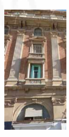
Fig.1 : Ornamental details of a Neo classic style residential/offices building façade; first level with plain shafts pedestals with ionic capitals and decorative motifs of shells and leaves, Diocletian windows with classical scroll form key stone, second level; fluted shafts pedestals with composite capitals with acanthus leaves decorative motifs, Tuscan columns on third floor balconies, with Greek geometric pattern, triangular pediment over windows, Voluted brackets, top frieze with dentils, sculptured birds and garlands. (Fouad St.)