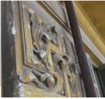
Fig.11 : Close up ornamental stucco bas relief detail of classical influenced building facade frieze with foliage embraced into Greek Key decorative border identifying infinity and unity. (Residential building in Fouad St.)