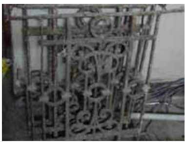
Fig. 12 : Ornamental detail of forged iron (fer forge) balcony grills with scrolls, circular and anthemion leaf patterns, wide spread classical rhythmical repetition of classical motifs. (Residential building in Fouad St.)