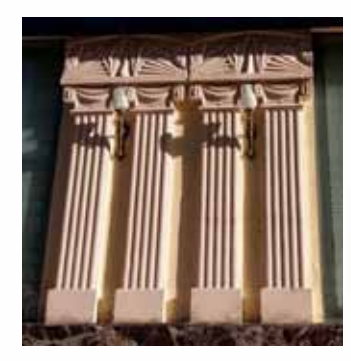
Fig. 14: Ornamental details of Art Deco Style residential building façade; the ground level has distinctive decorative sets of pilasters with a rectangular base and capitals of volutes and festoons, with a geometric radiating ornamental plate above it. (Fouad St.)