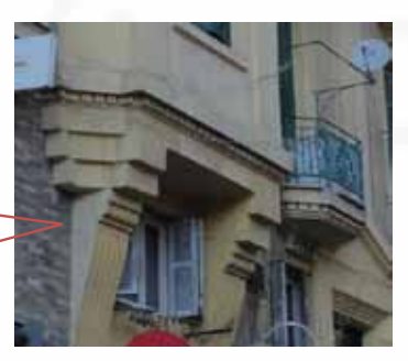
Fig. 16: Ornamental details of an Art Deco Style residential building, Lintel support of stepped angular ornaments and dentils with brackets of classic influences, balcony grills of abstract anthemion leaf, united by a desire to be modern. (Manshia District)