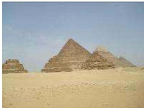
Figures 1, 2: The Sphinx and The Pyramids