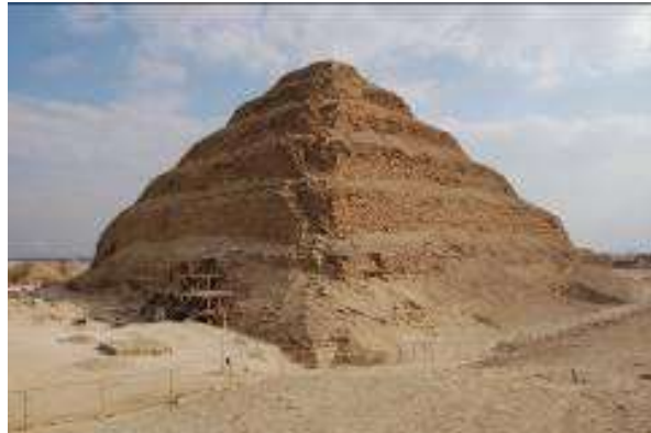
Figure 3: Saqqara Pyramid conservation project

but also an economic one due to its touristic value; making it a source of national income. 3 [ Figure 3]