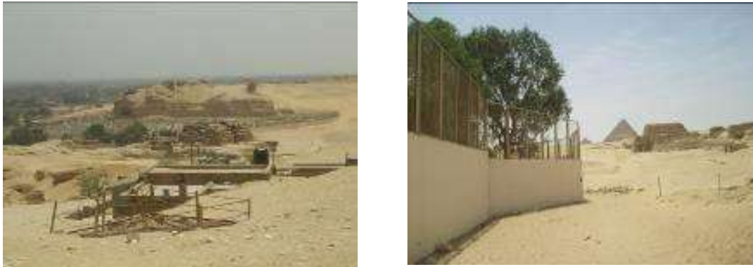
Figure 8, 9: Unsafe fences for The Pyramids area from Nazlet El Seman

Many of the new buildings such as The Pyramids administrative buildings, Khufu Solar Boat Museum, the police station and the storage buildings make negative impact on the area, since these buildings are not suitable for the historic context of the area from form and infra-structure points of view. The roads which penetrate the heritage districts create developmental pressure too; such as the case with The Pyramid Street and Sahara City Road, even The Sphinx Road which extends to the Menkaure Pyramid. [ Figures 8, 9] 6