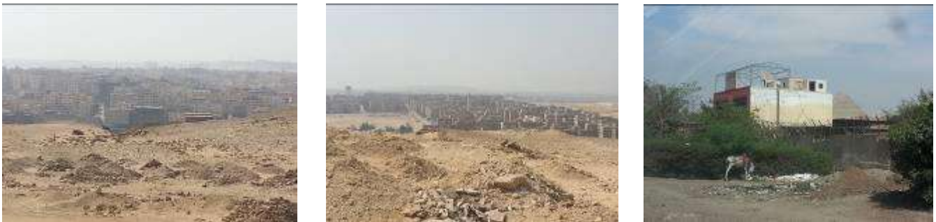
Figure 12, 13, 14: New urban areas attached to the heritage districts

After the area transformed from a state of hard accessibility into an easy one, thanks to the constructed bridges and roads, it became an attractive residential area. Even the surrounding agricultural areas contain now residences near to these roads. In the year 1983, The General Organization for Urban Planning in Egypt created a masterplan for Greater Cairo, including Cairo and Giza governorates. The plan showed new roads such as The 26 th of July Corridor in addition to phase 2 of the subway, and The Ring Road. These roads enabled people to take the new districts as their residence zones; as in the case of The 6 th of October and Sheikh Zayed cities and Pyramids Gardens neighborhood. [ Figures 12, 13, 14]