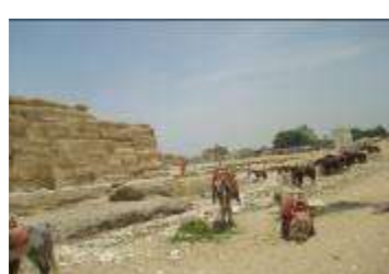
Figures 4, 5, 6, 7: Results of neighborhoods pressure on the district (unplanned animals move and urban crawl)